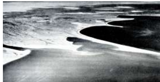
Aerial view of Lake Eyre by C.W. Bonython

The lake was discovered on 14 August 1840 from a high bank now called Eyre Lookout .