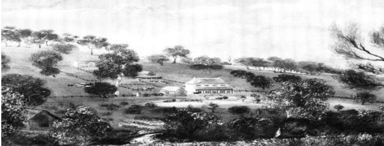
J.B. Hack's property 'Echunga Springs' in 1841

The origins of the name Echunga are debatable. The Aboriginal word Eechunga means 'close by'; but what was it close by? The river? The mountain? Some sacred site? No one can say. Another theory which is believable is that of the ornithologist who claimed the name came from the distinctive call of the rufous whistler, a bird common in the area. Certainly, the characteristic 'eeeeee-chung' of that bird is unmistakable.