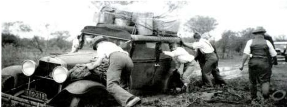
Bogged Birdseye mail bus in the 1930s near Elbow Hill Passengers assisting in the 'debogging' process