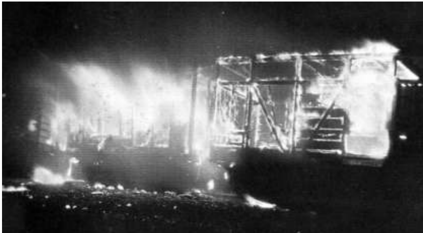
The 'Ghan' on fire at Edward Creek, 25 May 1934