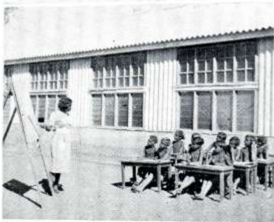
School at Ernaballa