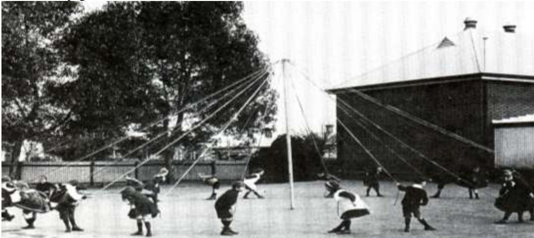
Maypole dancing at East Adelaide School

Photographs of the school appear in the Chronicle on 14 September 1907, page 32, of a school band in the Observer , 18 September 1909, page 31.