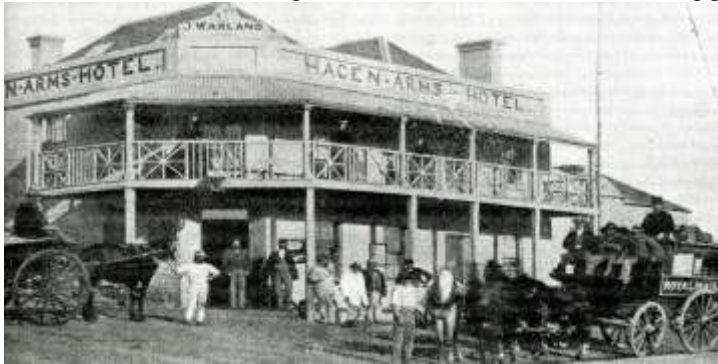
Mail Coach at Hagen Arms Hotel, Echunga – circa 1865

The present form of the Echunga Hotel dates from 1855, it having been first licensed in 1848 ... From 1853, the hotel has been known as the Hagen Arms... Following the discovery of gold in the area around Biggs Flat, five kilometres north of Echunga in the early 1850s, the town supported a second hotel called the Bridge Hotel. Built in 1857 as a one-storey structure, it was rebuilt as two storeys after a fire destroyed it in the early 1880s. When the town could no longer support two hotels the Bridge Hotel ceased trading in the 1920s. Nothing of it remains, after the last remaining part was demolished in the 1950s.