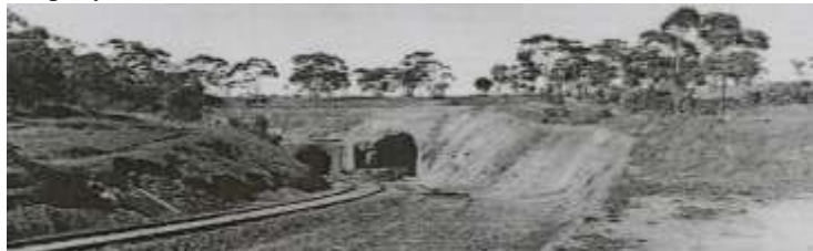
Old and New Railway Tunnels near Eden Hills - 1927

In September 1869, a correspondent from Eden Valley advised that gold had been found on the edge of the Murray scrub about ten miles from the village. Later, it was reported that the government intended to declare a gold field at the locality and that the Warden was making arrangements for the issue of licences and the settlement of claims. Subsequently, the South Rhine Gold Mining Company on the Murray Flats was wound up in July 1870 and the directors reported that they were ‘much disappointed in the results of auriferous deposits made by Messrs Pavy & Company...’