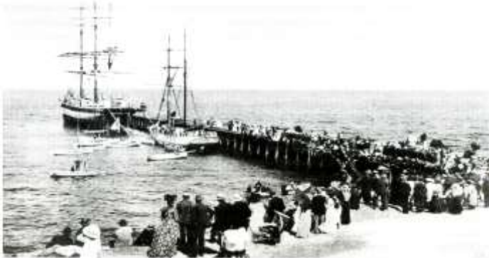
Edithburgh Jetty in 1908

In 1877, there was a report of the laying of the foundation stone of the State school; it opened later that year and 'on 14 May 1901 the Union Jack was hoisted on the flagstaff at the school. At a given signal the other flagstaffs in the town were decorated with bunting.' (See East Adelaide )