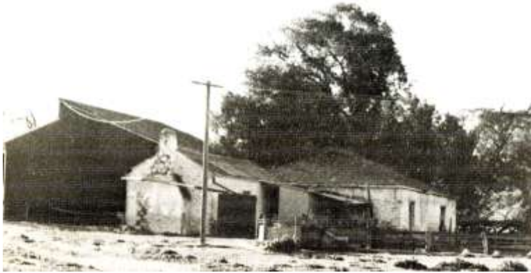
Original Emu Flat Homestead

The Emu Flat Forest Reserve , near Keith, was land that, in 1887, came into the possession of the government through the non-payment of rent by the lessee: