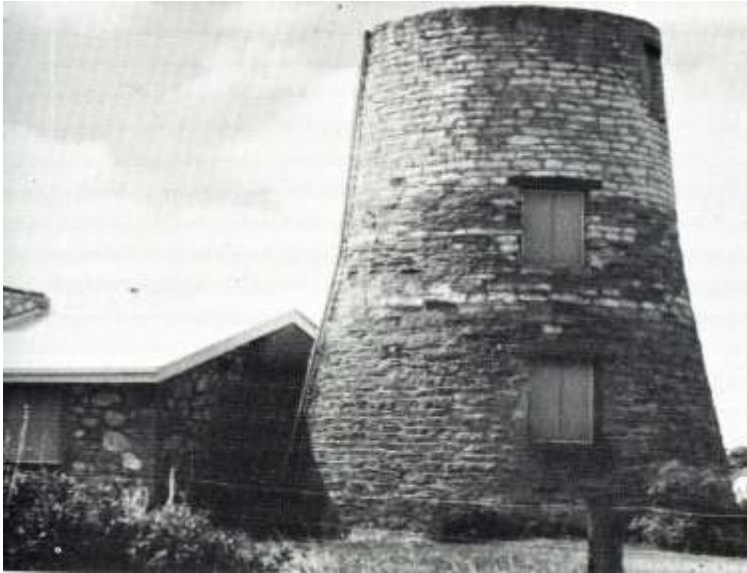
A Wind Driven Flour Mill at Encounter Bay, built circa 1855

The assurance by the Resident Commissioner that there should be a town at Encounter Bay has been cleverly evaded by placing it where no one will buy it.