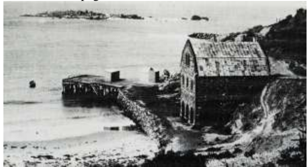
Port Elliot Landing Stage – circa 1880

Sketches of the town are in Frearson's Weekly , 22 February 1879, page 11, Pictorial Australian in March 1879; photographs are in the Observer , 17 February 1917, page 26, of the opening of a tennis club in The Critic , 26 December 1903, page 10, of the opening of the post office in the Observer , 3 September 1910, page 31, of school visiting day on 19 August 1911, page 30, of an Australia Day celebration on 7 August 1915, page 29, of a recruiting train on 6 May 1916, page 23, of former school teachers on 12 April 1924, page 32, of Australia Day celebrations in the Chronicle , 5 August 1916, page 27, of a life saving team on 21 February 1935, page 32, of a football team on 21 October 1937, page 32.