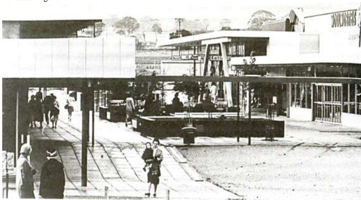
Elizabeth Town Centre in 1963

There are grounds for supposing that this state of affairs will be reached in a few generations in South Australia. The rapid growth of population and industrial growth in this State emphasize the need for either developing existing towns or establishing new centres and it is against this background that the planning of Elizabeth began.