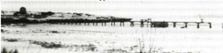
The 1881 jetty at Elliston

Its school opened in 1880 while the town's first jetty was erected in 1881 and severely damaged during a storm in April 1896. A new structure was approved to the west of it in 1900 and, today, it is on the State's Heritage Register.