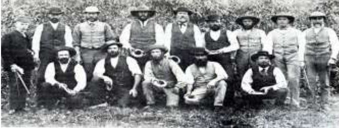
Echunga Quoits Team in the 1880s

The first examinations at the Echunga Government School were held on 13 April 1854 when the following pupils obtained prizes: