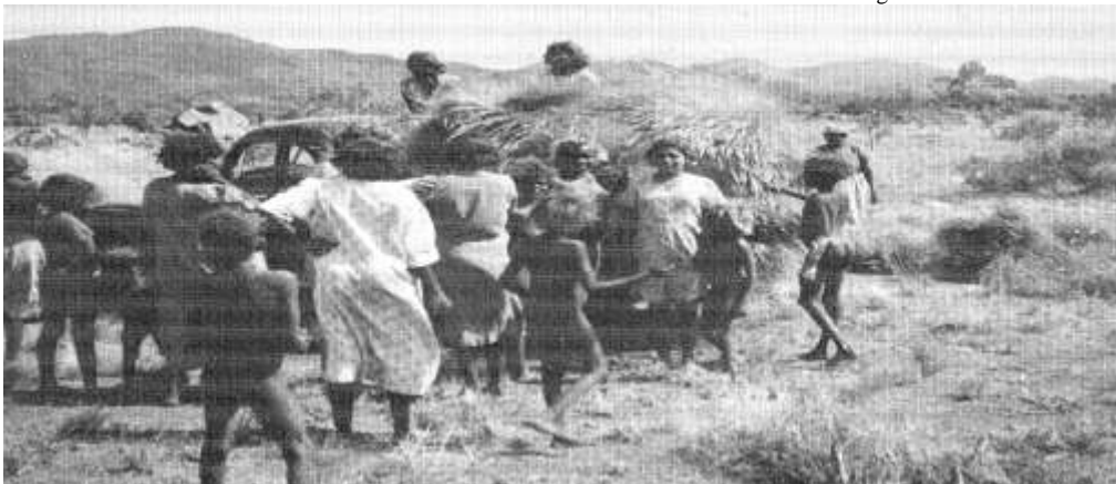
Ernaballa Aboriginal girls laughingly collecting spiny Spinifex for use in building their wurlies