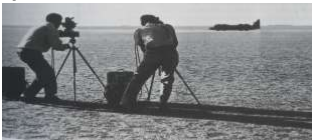
'Bluebird' on a trial run in late 1963

Lake Eyre is the largest lake in Australia and lies in an area receiving, on average, less than 120 millimetres of rain per year and, accordingly, its surface is usually dry and covered with a salt crust of up to five metres thick. It was used by Donald Campbell to break a world land speed record on 17 July 1964 when he attained the speed of 403.1 mph.