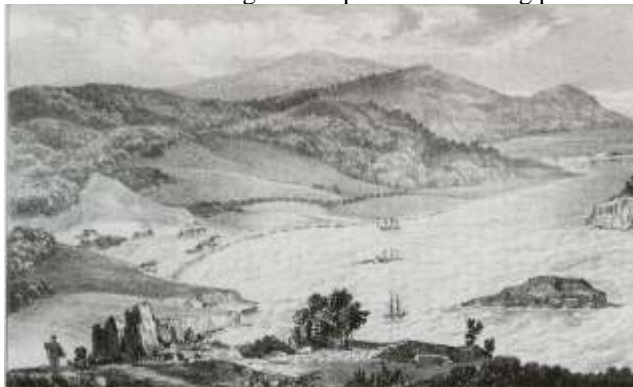
Encounter Bay at the time of the first settlement

In case Mr Finnis should not furnish you with the information which you sought of him relating to the township at Encounter Bay in your last number I beg to answer your question myself. The town acres have been measured - a part of them two or three miles up a valley out of sight of the sea, and the rest of them, not opposite Victor Harbor, but all along the bay from Granite Island towards Rosetta Harbour, where there is no anchorage for ships and no landing place for boats.