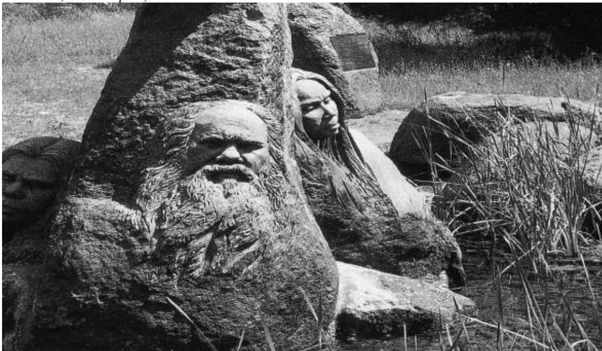
Gaurna Monument at Colebrook Home – Eden Hills