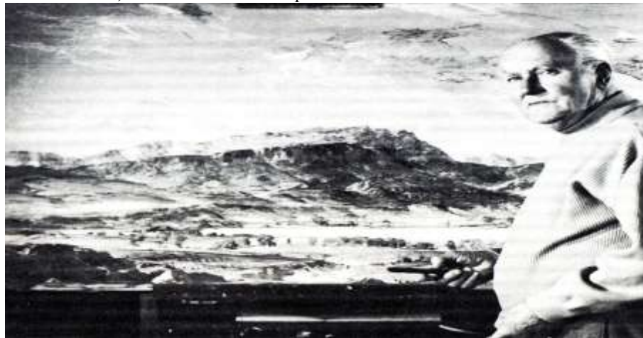
Hans Heysen with one of his paintings of the Elder Range and Arkaba country