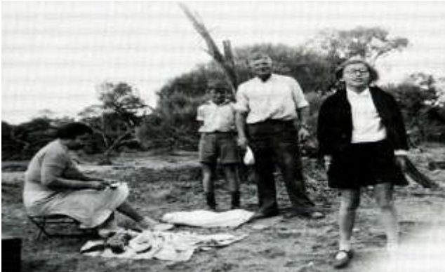
Lunch time en route to Evelyn Downs

Evelyn Downs - A pastoral property near Oodnadatta,