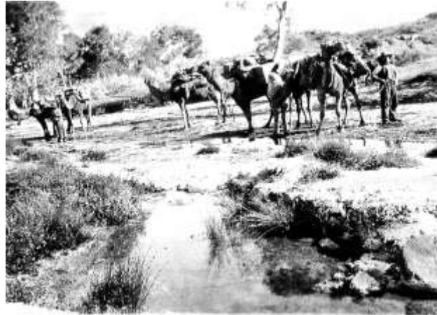
Camels drinking at Ernaballa Creek