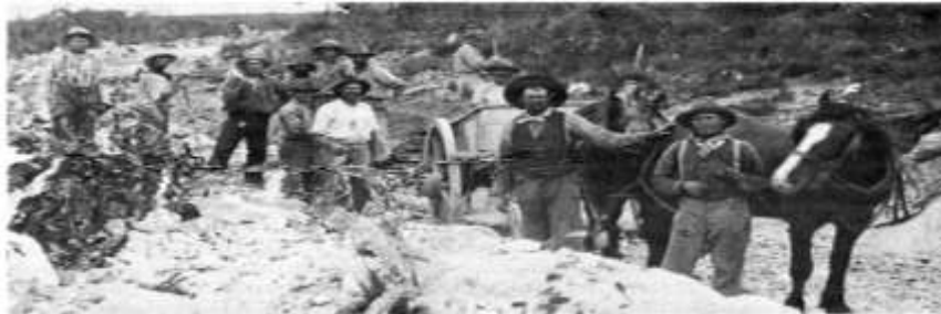
Early road making in the Elliston district

Governor Jervois named 36 towns in South Australia and, invariably, remained within the realm of family and friends when christening the creations of government and, on 23 November 1878, he wrote, simply, on a 'Plan for a Town at Waterloo Bay', the word 'Elliston'. At the time of his appointment, Governor Jervois was a Lieutenant-General, having joined the Royal Engineers in 1839.