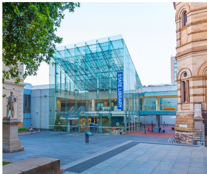
State Library Forecourt