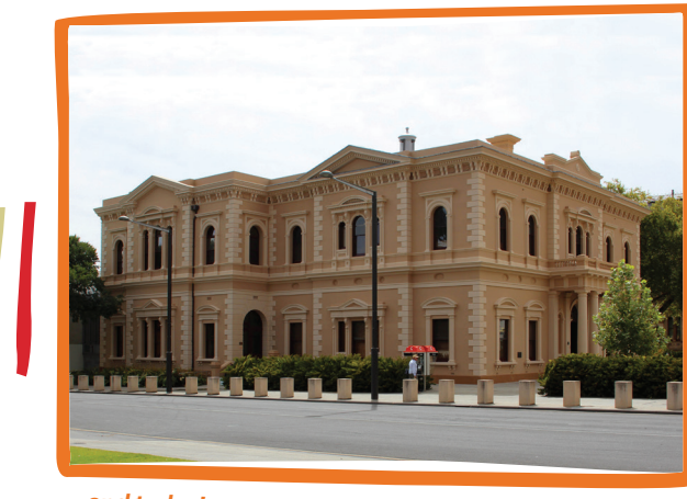
... and today!