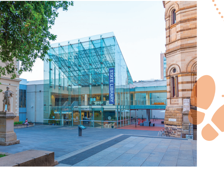
State Library Forecourt