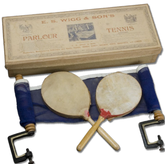
Table Tennis Set

c. 1950s, From the Children's Literature Research Collection